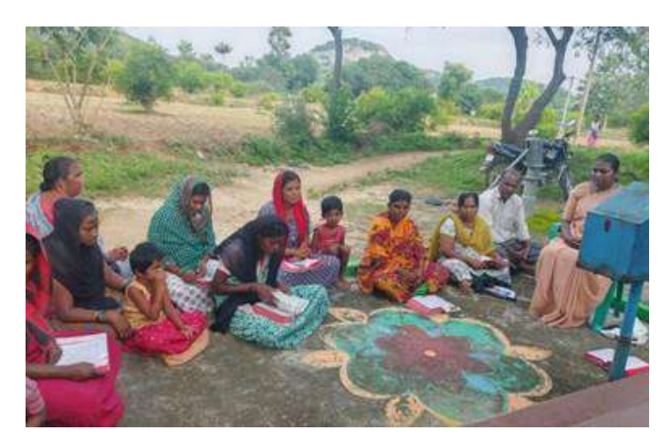
Bible study by Parishioners