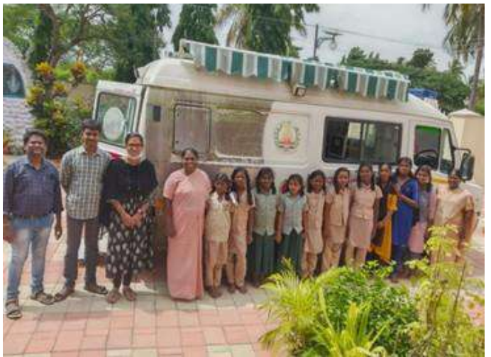
Medical check-up for children associated with children Home