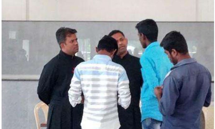
Blessings from Camilliam Father

They have been a great support to our patients during the Covid Pandemic by providing nutrition kits worth ₹ 4,80,000/-. They also conducted training programs of our children in CCI.