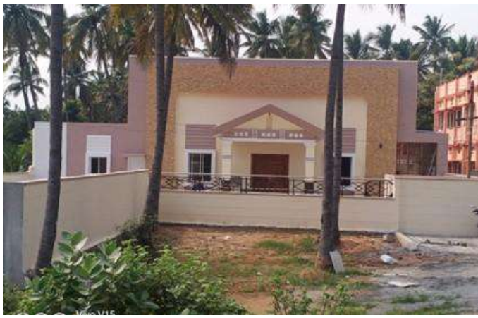
Front view of Community Hall

Functionally, we utilise hall for larger gatherings like meetings with PLHIV, organise celebrations, summer camps, Tuition for children. It is also flexible as place to rest and study for tribal college students.