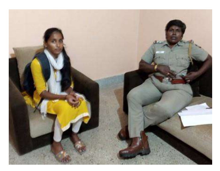
A girl bought by police department related to CWC

Most of the cases tend to happen due to lack of awareness, misconception of people, situations, to flee away due to irresponsible parents, etc. Most Importantly, Today's children are misguided due to the digital world and no proper love, care and guidance from parents.