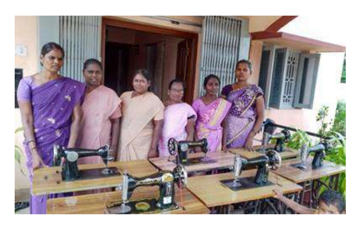
Distribution of Tailoring machine for PLHIV