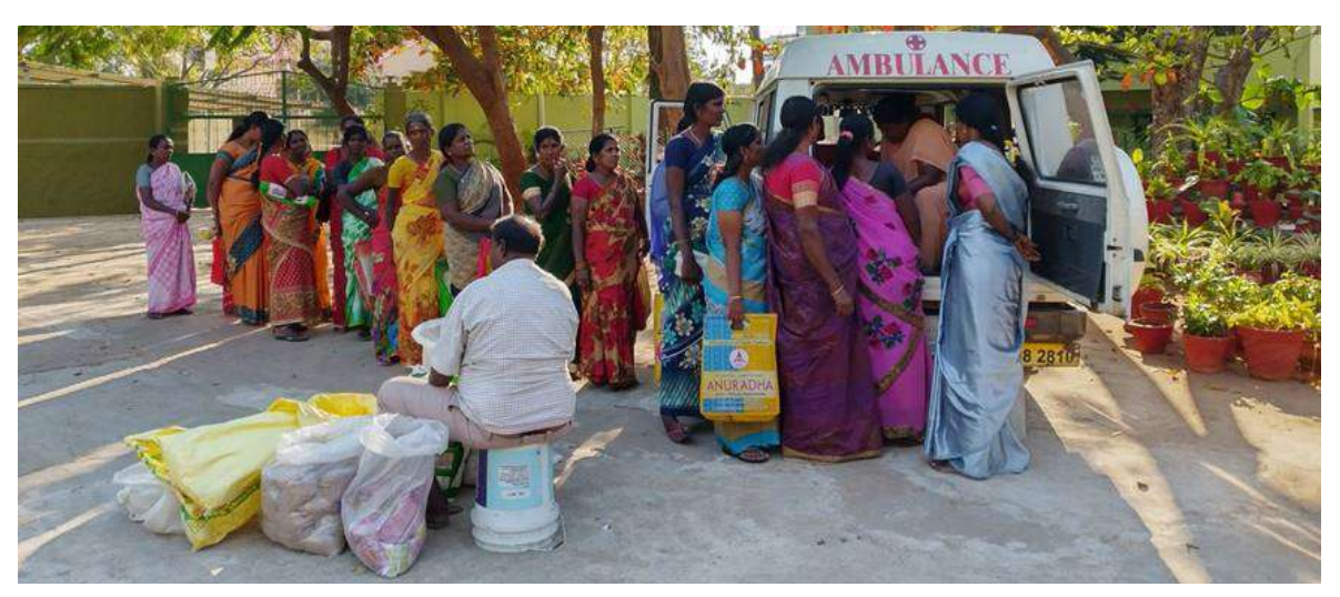
Nutrition Kit distribution