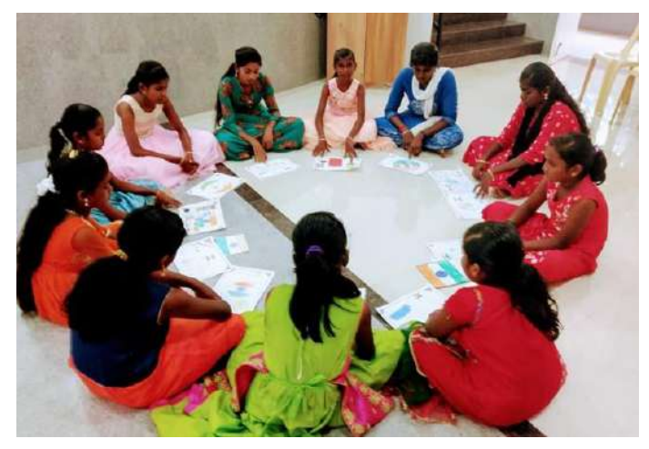
Children meetings and discussion on extra-curricular activities

Children conduct meetings within themselves to improve skills like leadership quality, decision making and problem solving, focussing to evolve a better leader. Parents meeting are held twice a year to discuss on their distinctive skills, education and career growth. Children without safe home live with CCI even during holidays. They also actively help sisters in social works and involve themselves in the parish spiritual activities. It contributes to better community and social cohesion.