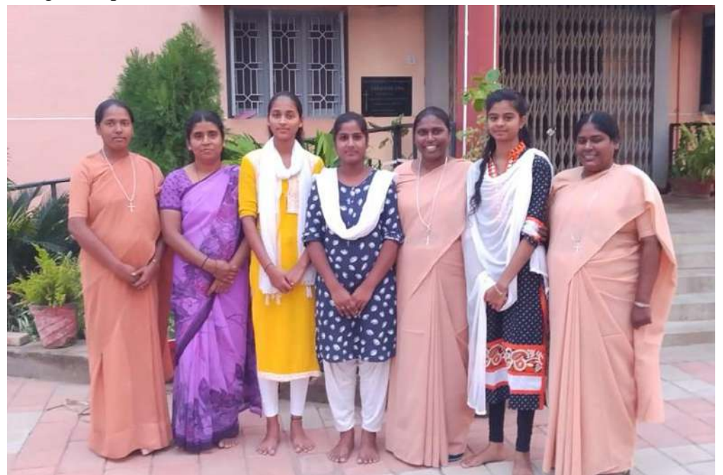
Group of Girls involved with POCSO & CWC with sisters

Through the guidance of the Holy Spirit, we lead them for better future, provide protection and handle extreme critical emotional phases of children. Social, emotional, physical aspects are few challenging situations that minor girls experience.