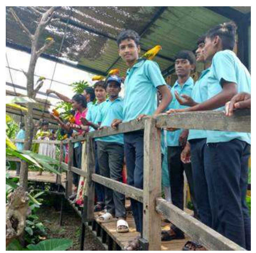
Involvement and playing with Birds