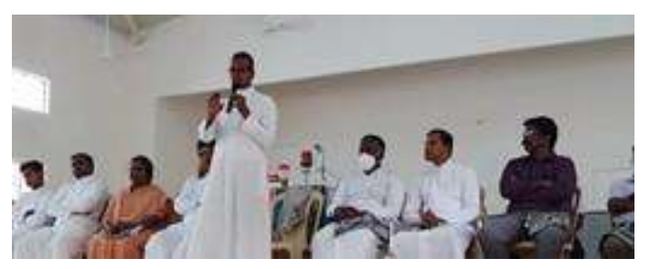
Inauguration of Community Hall