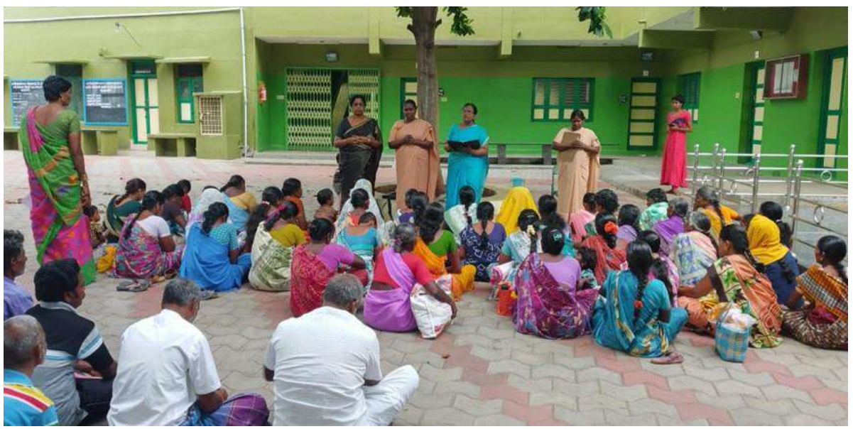
Awareness program related to Nutritional supplements

We provide varied programs under 3 Centres, covering 9 Blocks in Bargur, Krishnagiri, Hosur, Kelamangalam, Thenkanikottai, Soolagiri, Mathur, Uthangarai and Kaveripattinam.