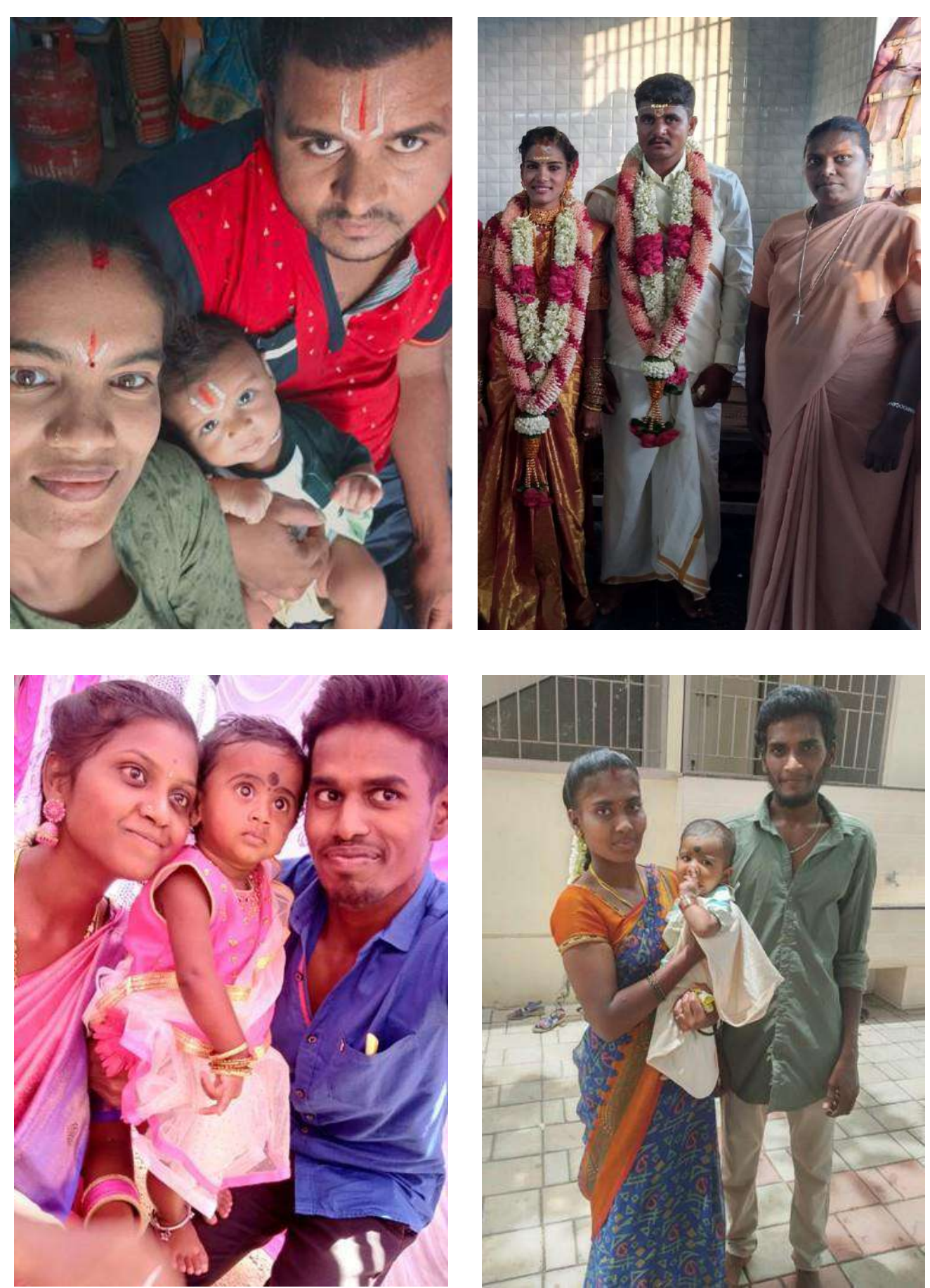
Youth group married and given birth to HIV negative child

Our aim is to provide them proper educational support for career development, get them married to other PLHIV and give birth to negative child