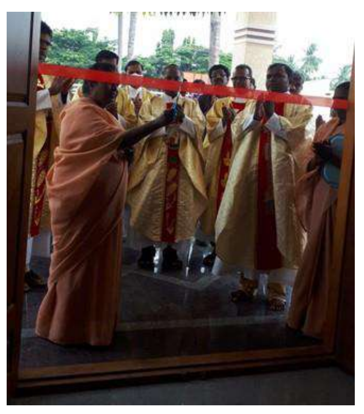
Inauguration of Community Hall