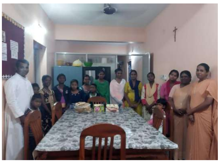
Children's Day Celebration