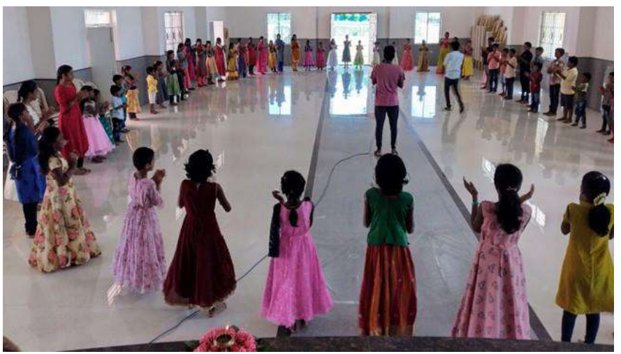
Physical group activities

After all the activities, we had sessions to enhance mindfulness like yoga, breathing exercise and dance. Reflection and learning of the day were concluding sessions by sharing it with the whole Team. Irrespective of activities, Children tend to realise diverse skills about themselves and enjoy the process with complete involvement and presence.