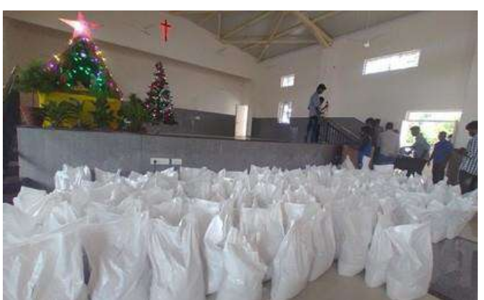
Packed Nutrition Kits sponsored for distribution