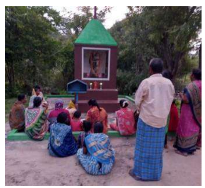
Prayer at the St. Antony's Grotto