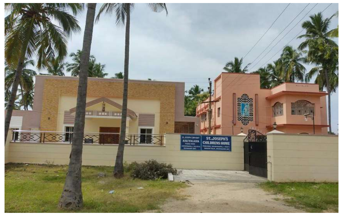
St. Joseph's Children Home (Right) & Community Hall (Left)

We began our journey placing our total trust in the almighty God who brought us together in this abode of unity to share the light of spark amidst the poor and marginalized children to create a more compassionate and ethical society.