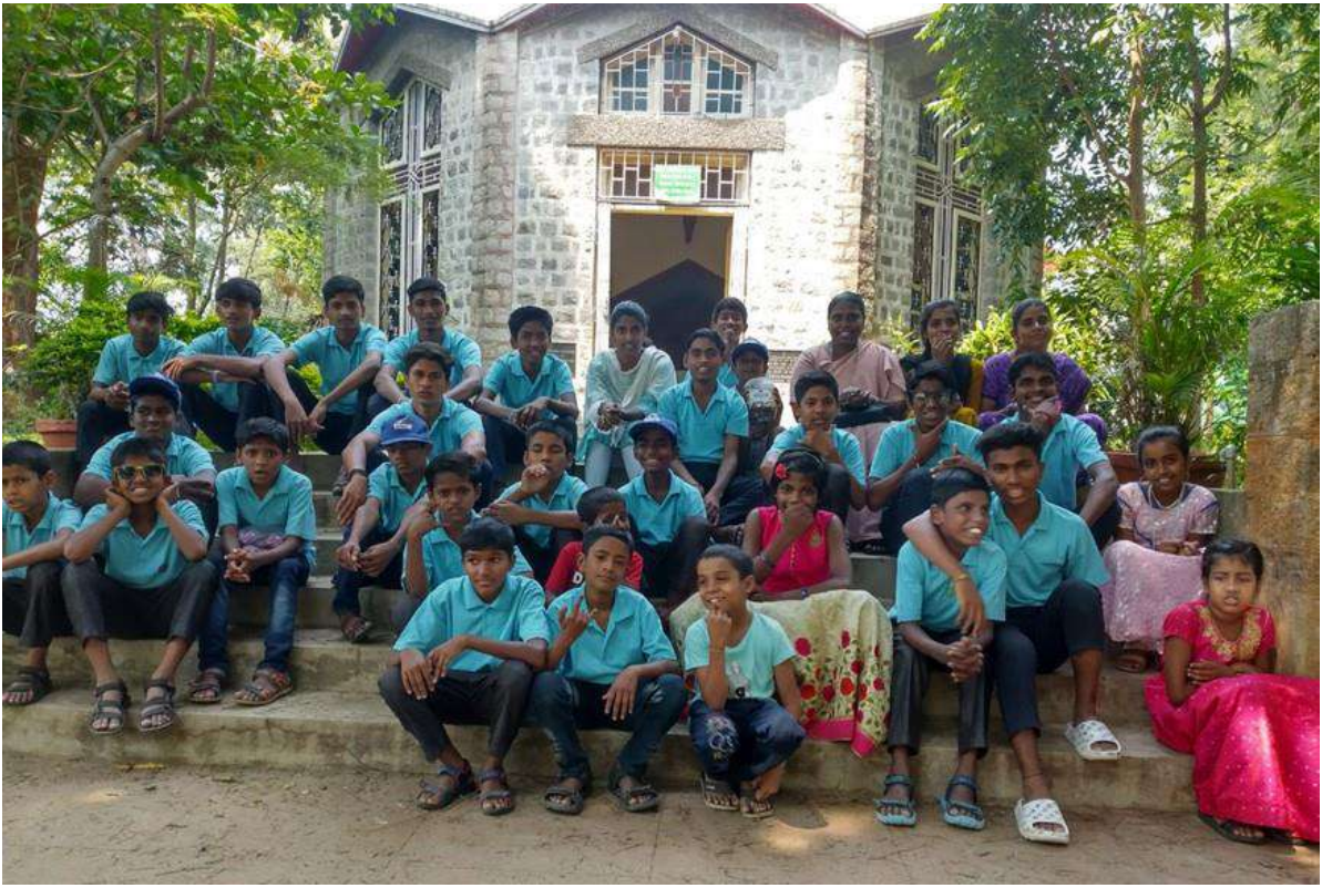
Group of children participated in Summer Camp

Along with different activities, we visited places like Yelagiri bird sanctuary. A very refreshing experience with all happiness as they involved with nature by playing with birds, boating, etc. These involvements greatly helped them in social interaction, communication, and spread of varied awareness with each other. Children were well-disciplined and trained under our sisters. It helped all of us to indulge in activities efficiently.